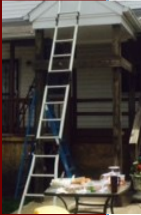
Back porch, play area Flowers and Garden