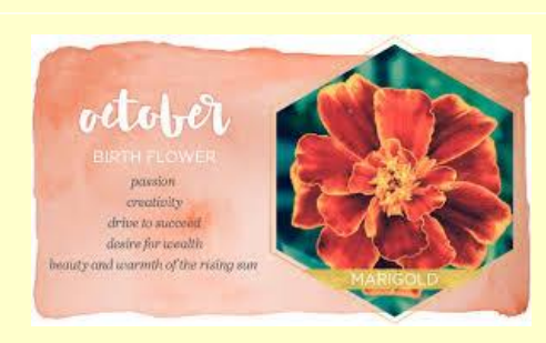
October Flower Marigold