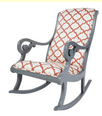
The Lost Art of Visiting By Amy Hursey