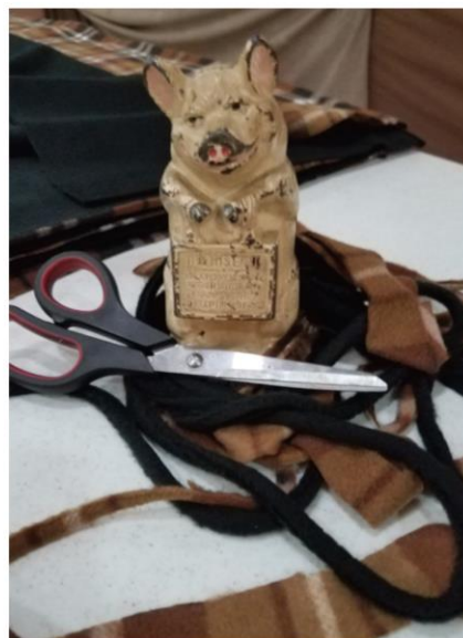
The Original Pig in a Blanket...Thrifty Pig!