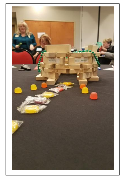
Our Raffle Basket