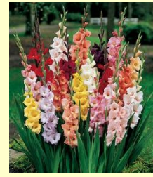
August Flower Gladiolus

Visit the Muskingum County Fair August 13 th to the 19 th Daily Admission is $5, but there is a promotion each day that allows fair goers to get in for FREE !