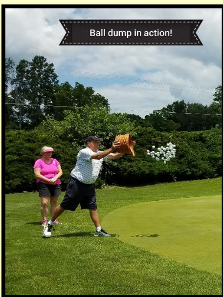
Ball dump in action!