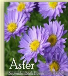
September Flower Aster